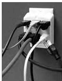
Have additional outlets installed. Don't take a chance on overloading circuits and creating a fire hazard.

In celebrating electrical safety month, KPU D wants to remind its customers to inspect their homes to make sure they are free of electrical accidents waiting to happen.